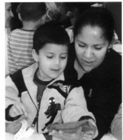
Mother and child enjoy a pre-literacy workshop activity.

Families were provided with dinner and childcare to enable them to attend the series of three workshops.