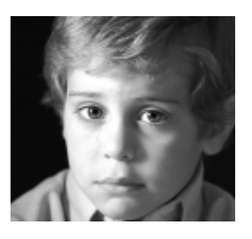
Research demonstrates that Functional Behavioral Assessments (FBAs) and Positive Behavioral Interventions and Supports (PBIS), when used correctly, reduce the need for traditional school discipline such as suspension and expulsion—procedures that are unsupported by research.

Now, six years after passage of IDEA '97, parents and advocates report that implementation of the new provisions is erratic and often perfunctory—that schools appear more concerned about the illusion of compliance than about effective use of the tools to prevent and address behavior problems. Schools are increasingly taking a different tack from the ideals espoused in the IDEA '97, using zero-tolerance and other disciplinary policies to make it easier to remove students who exhibit problem behaviors. This year's reauthorization of the IDEA has brought cries for the federal government to officially sanction such practices by eviscerating the protections for students with disabilities that are currently in the statute.